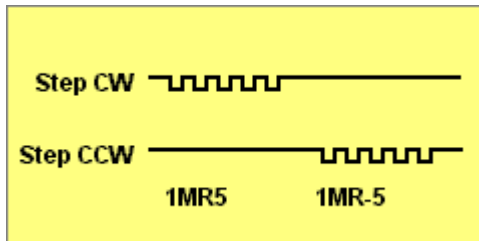
Figure 2: Step CW / CCW Operation

The second (non-default) mode of operation is Step CW / CCW. In this mode of operation the Direction output from above becomes Step CW and Step becomes Step CCW . The output square wave will appear on one or the other of these two outputs depending upon the direction the motor has been commanded to move.